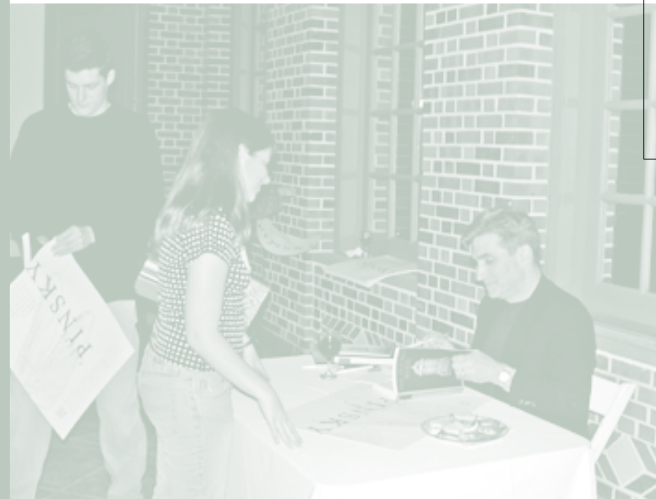
Robert Pinsky talks with students and signs copies of his writings after a poetry reading held in the Newcomb Art building.

Last year, the Lupin Foundation, a New Orleans-based family foundation that supports culture and the arts in the community, solicited grant applications from the various offices and departments of Tulane University. The Office of Tulane College Student and Alumni Programs proposed to bring to campus an especially distinguished representative of any field related to the liberal arts—a lawyer or politician, an economist, a philanthropist, a musician or entertainer, an artist, a