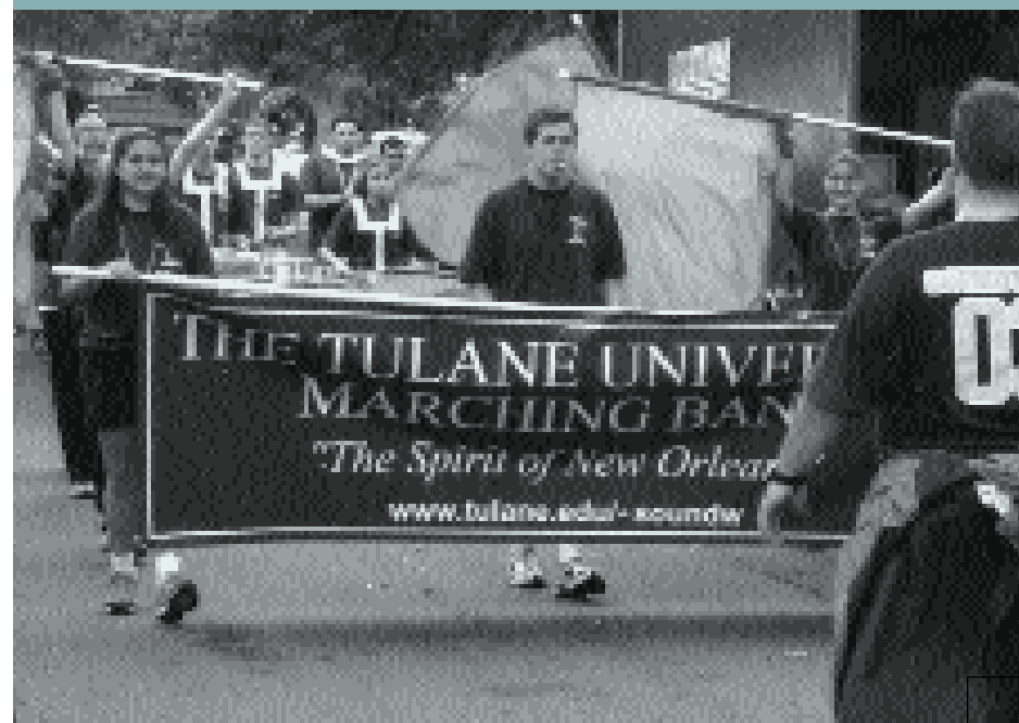
Tulane Marching Band, 2003